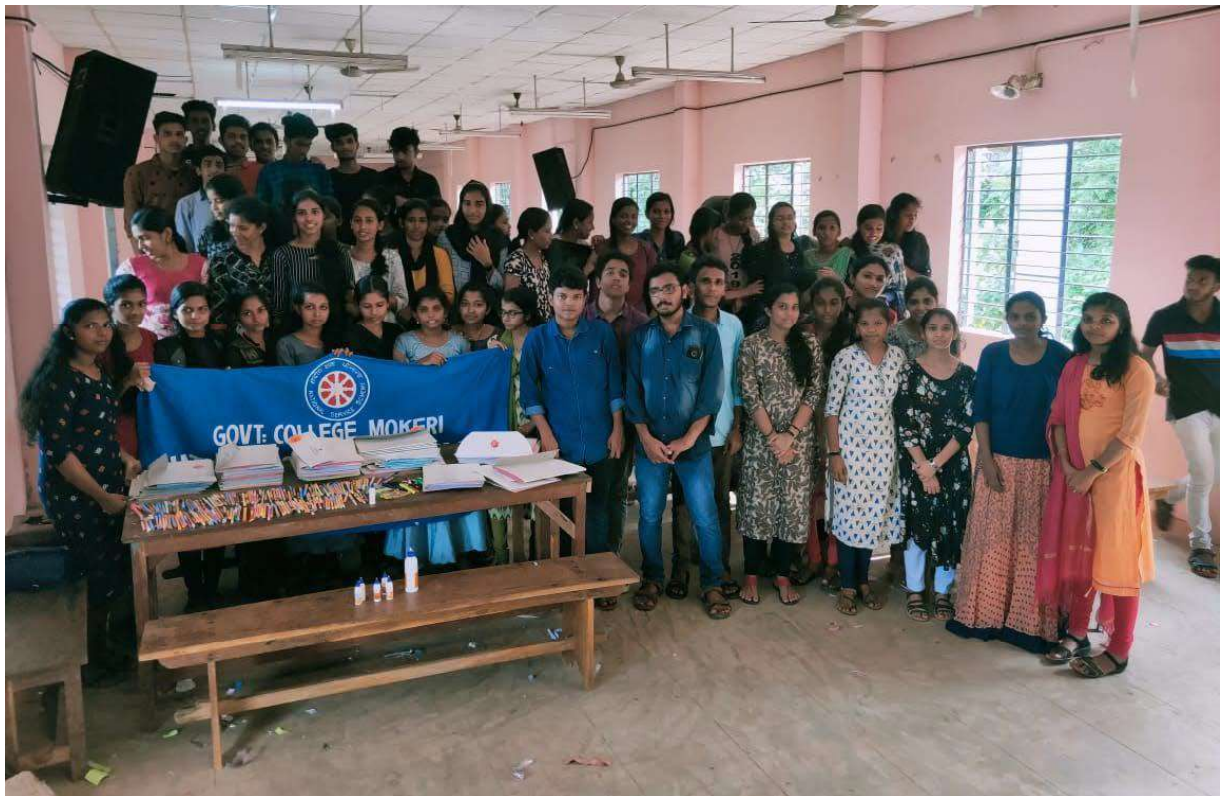
Our unit with crafted work