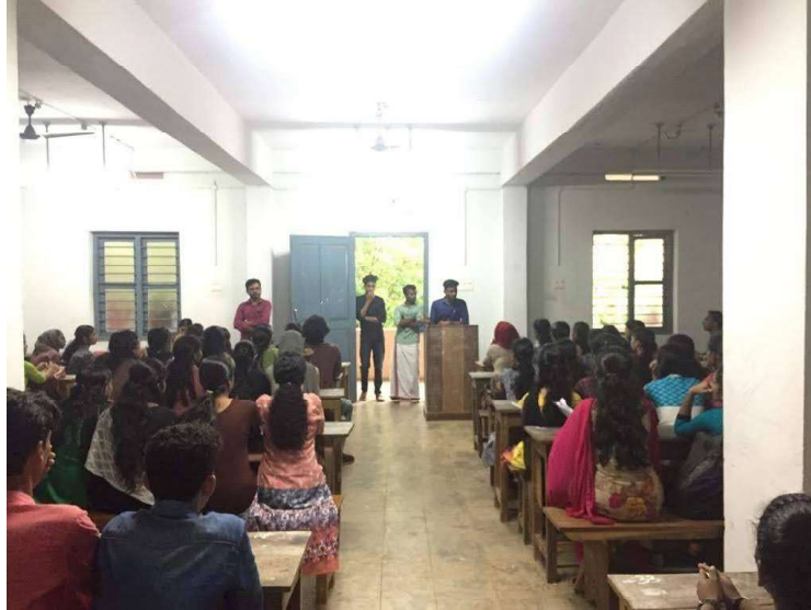
NSS volunteer secretary reading preamble of our constitution

In collaboration with the College Union a debate was conducted for the students.