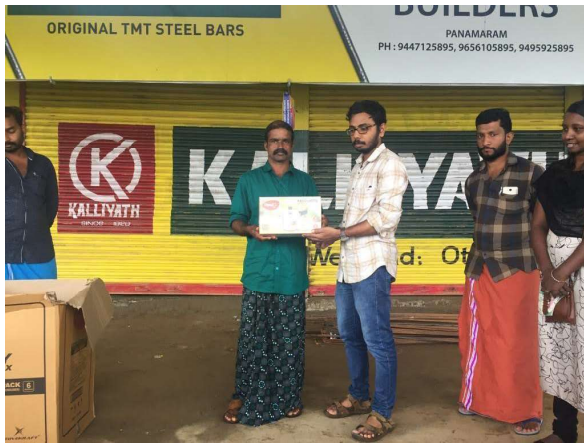
Volunteers distributing house hold thing to the flood affected houses

The NSS units, in collaboration with College Union, distributed food items and dress materials worth Rs. 50,000/- to one of the flood relief camps at Nilambur, Pothukkallu in Malappuram district.