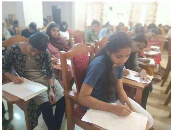
Students participating in essay writing competition

As part of Gandhi Jayanthi, an essay writing competition, was organized on the topic ‘The Importance of Gandhian Ideas at the Present Scenario’. Students were actively participated in the competition and penned their thoughts. The winners were awarded.