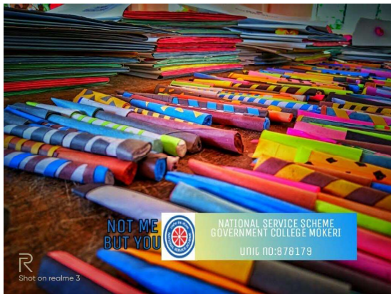
Students making paper pen, paper file, paper bag etc.