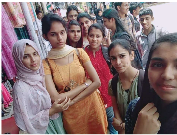
Volunteers collecting money for flood relief activity from public