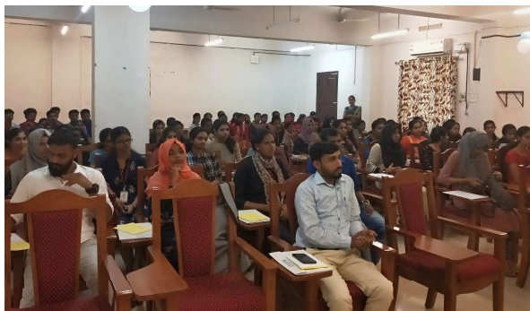
Students and teachers providing our handcrafted paper file, paper pen, paper booklet, during the National Seminar