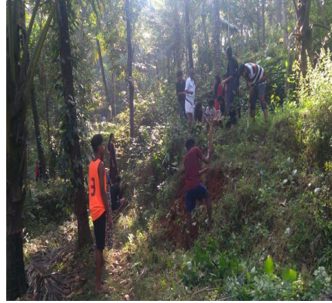
Volunteers constructing road.