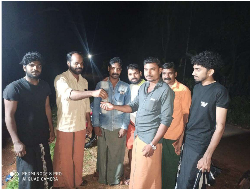
Ward member handing over gold chain to the owner

One of the volunteers got a gold chain unexpectedly from road side during this time. Without any hesitation it was handed over to the ward member. He returned it to the owner.