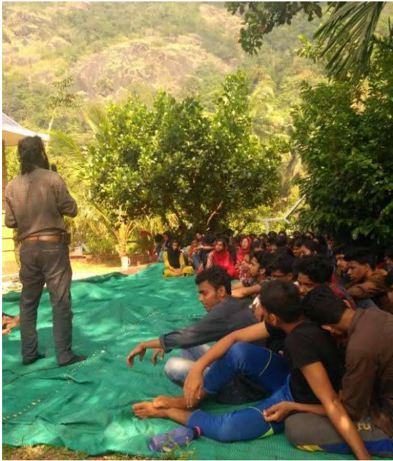
Watching solar eclipse during camp